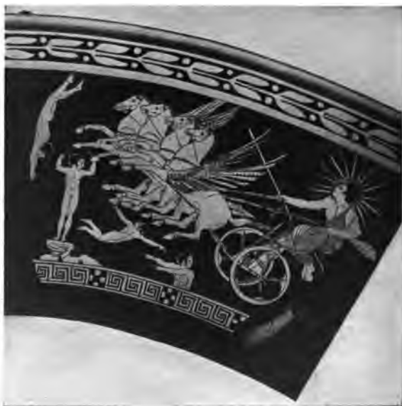
Fig. 15. The Sun-God in his Chariot.

prophetic gift. The most famous of all oracles was that at Delphi, a town of central Greece situated on the slopes of Mt. Parnassus. Here the priestess, seated on a tripod over a cleft in the rock, was thrown into an inspired frenzy by the